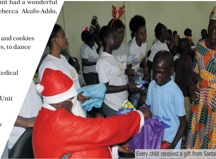
Every child received a gift from Santa

Some of the activities that took place were musical chairs and dancing competition and winners were awarded various prizes.