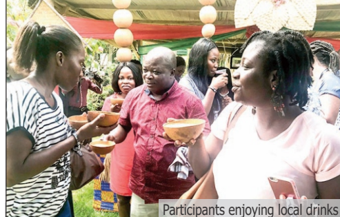
Participants enjoying local drinks