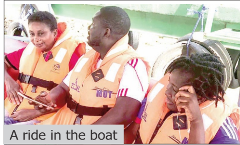
A ride in the boat