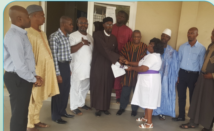
The National Chief Imam, Sheikh Osman Nuhu Sharabutu, presented GHC 10,000 to offset some insolvent patients' medical bills