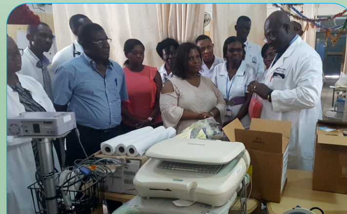
Oklahama Ghanaian Communiy Group (OKGCG) donated an Electrocardiogram, Feeding bags, Teriband and BP apparatus to enhance care at the Stroke Unit