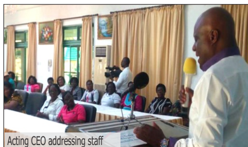
Acting CEO addressing staff