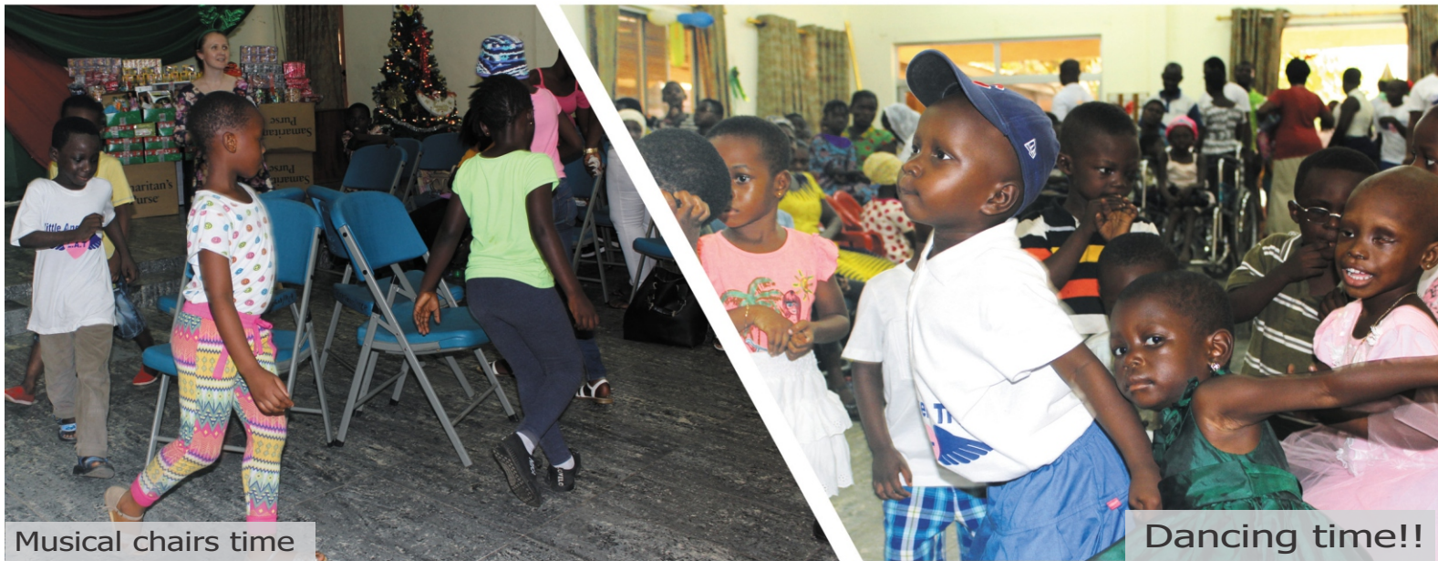
Musical chairs time