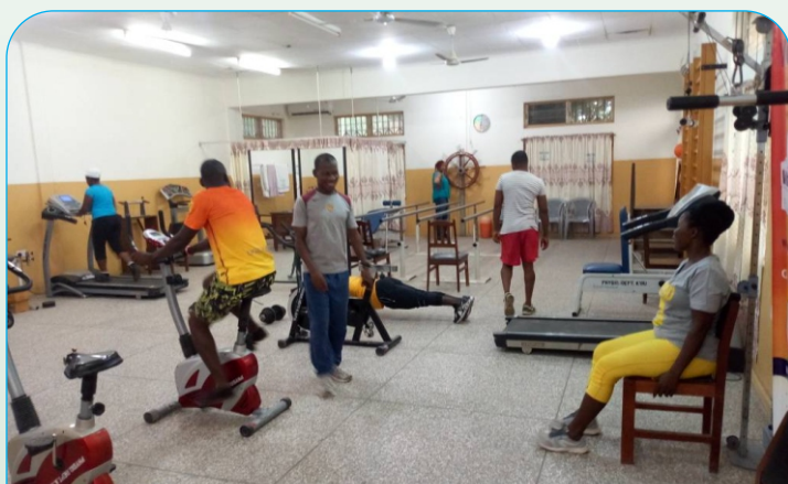
The Physiotherapy Department has started fitness sessions for staff. The training is scheduled for weekdays from 5:30am - 7am