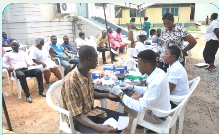
The HSWU, Korle Bu Chapter, organised health screening for their members