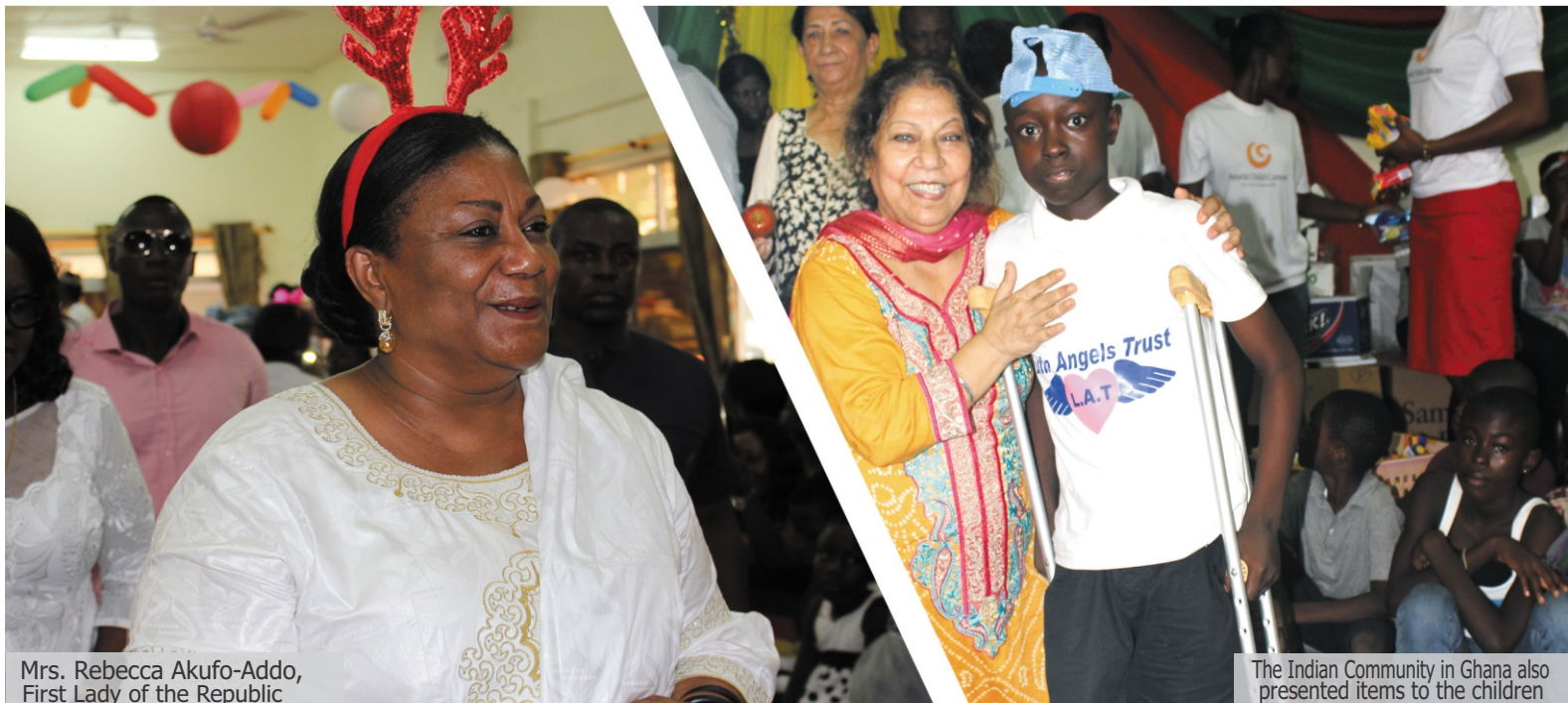
Mrs. Rebecca Akufo-Addo, First Lady of the Republic