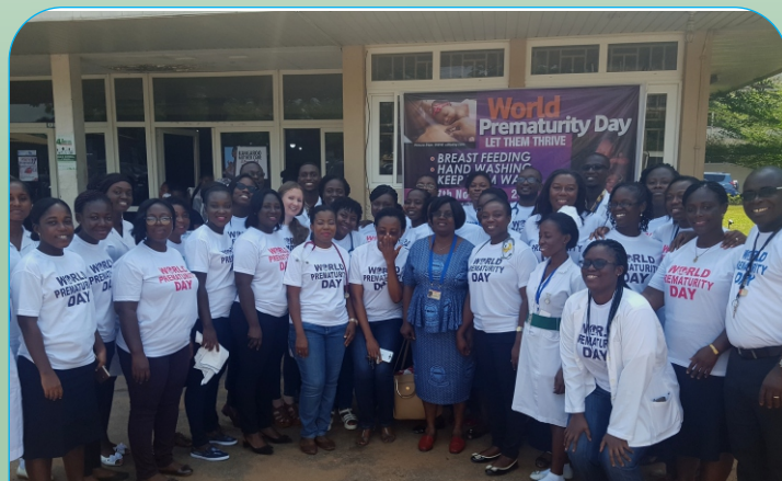
The 2017 World Prematurity Day was celebrated in the Hospital with a public lecture in the media and at the Child Health O.P.D