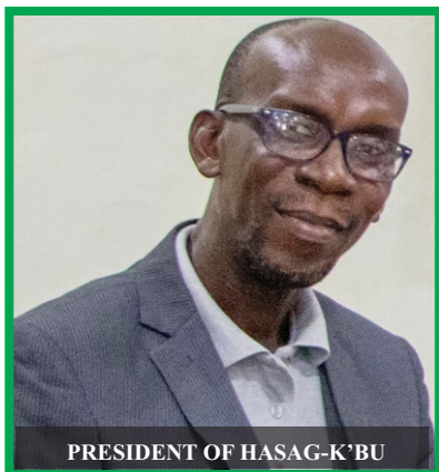
PRESIDENT OF HASAG-K'BU