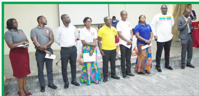
The new Executives

Congratulations to the New Officers and the entire HASAG membership.